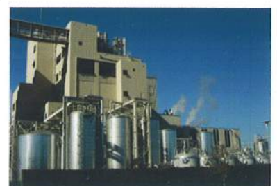
Many industrial uses. Solution transfer, filter systems, fume scrubbing, off-loading tanker trucks.