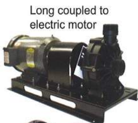
Long coupled to electric motor