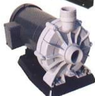
Close coupled electric