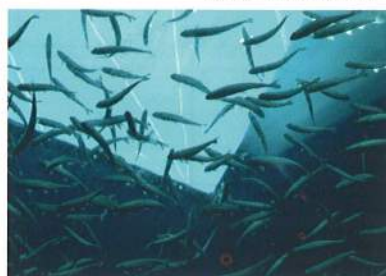
Many uses in agriculture and aquaculture. Recirculation, filter systems, transfer from totes and tanks.