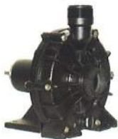
Pedestal mounted for long coupling

* 5 HP single phase motor is 230 volt only. Available flexible coupled (pedestal mounted) See OPTIONAL ** GPM @ 1750 & 3400 RPM, 60 Hz motors; LPM @ 1450 & 2850 RPM, 50 Hz motors.