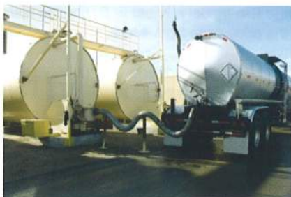
Tank truck unloading.

Impeller numbers are indicated on curve. NOTE: pump performance is slightly greater with engine drive (3600 rpm) See chart on next page.