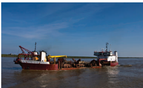
MANY TYPES OF SALTWATER APPLICATIONS